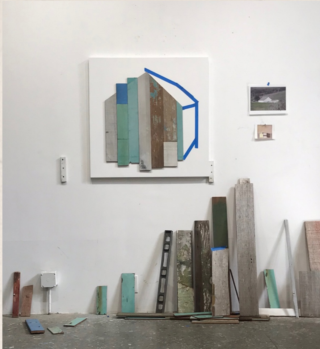
Sometimes my love of the boards determine the design.