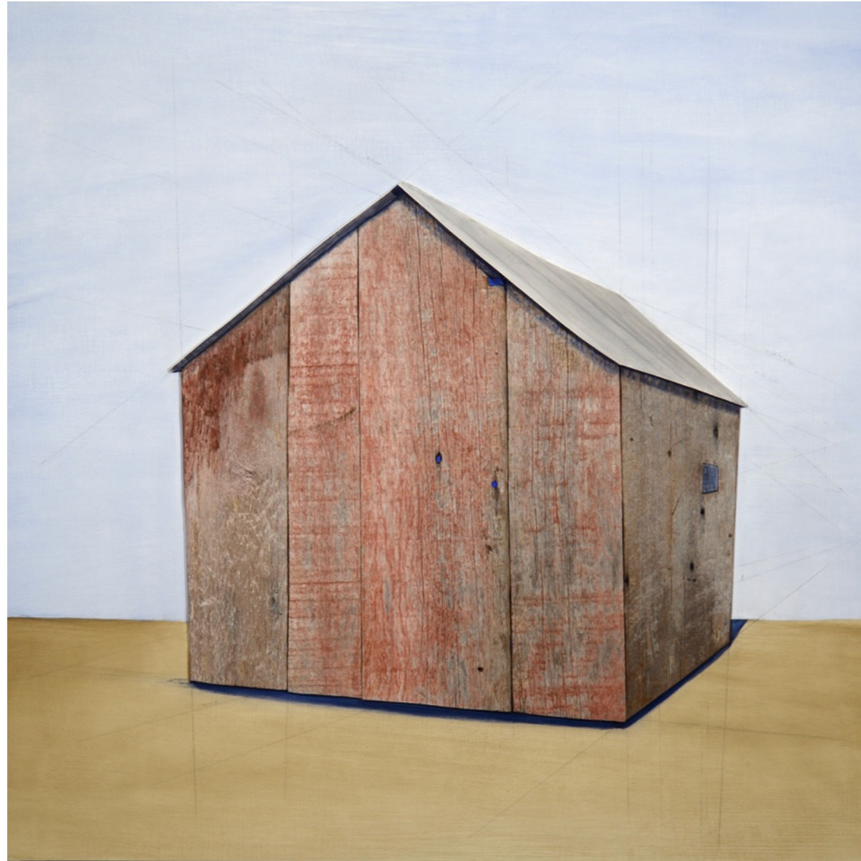
Pink Barn Valley Deep End wood, plaster, pencil and paint on wood panel 40x40x2 inches