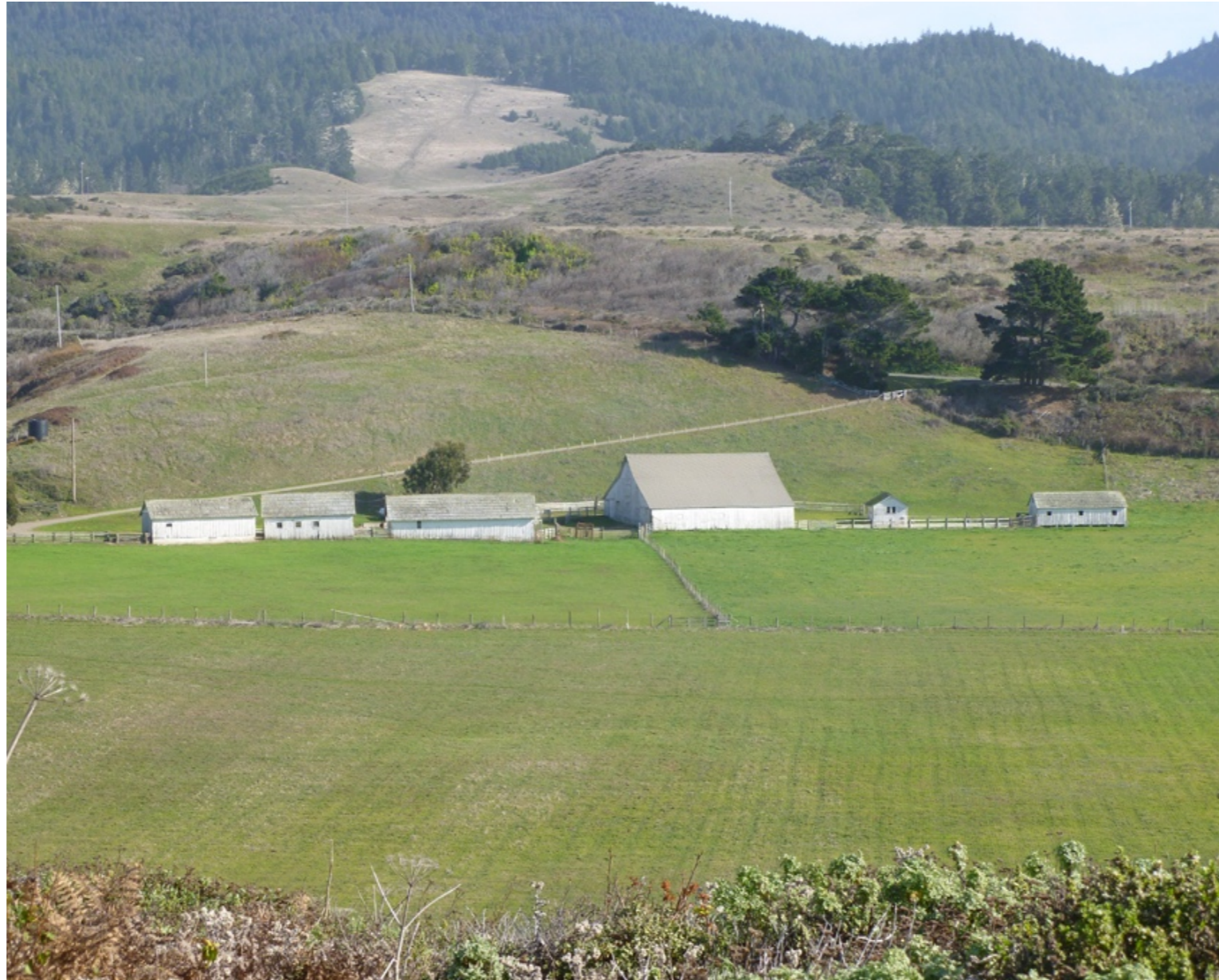
Alder Creek, Manchester, Northern California