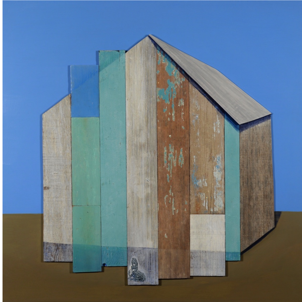
Barn Variation listening to Goldberg Bach

wood, plaster, pencil and paint on wood panel,