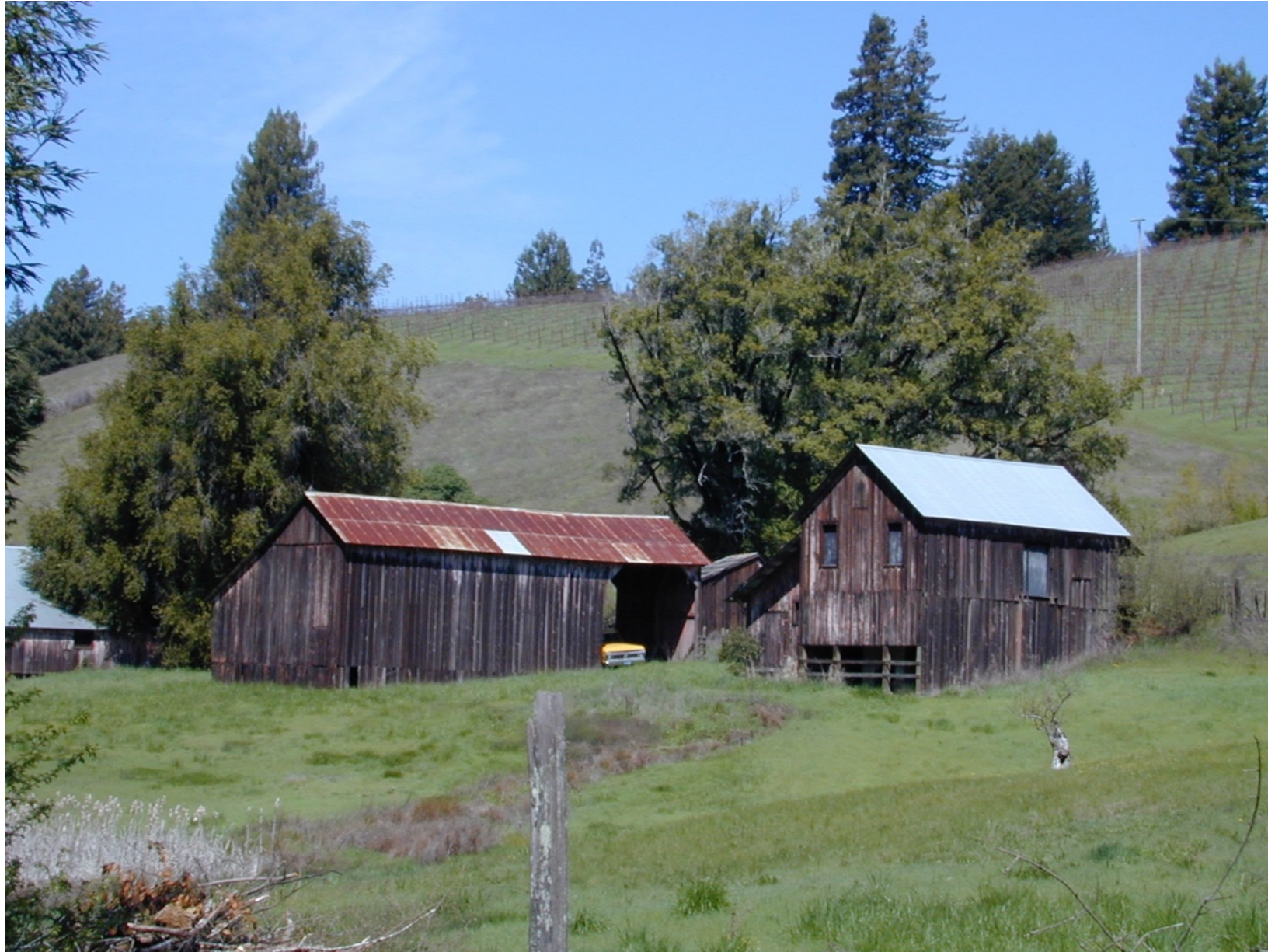
Horse Haven Ranch, Highway 128, Philo, California