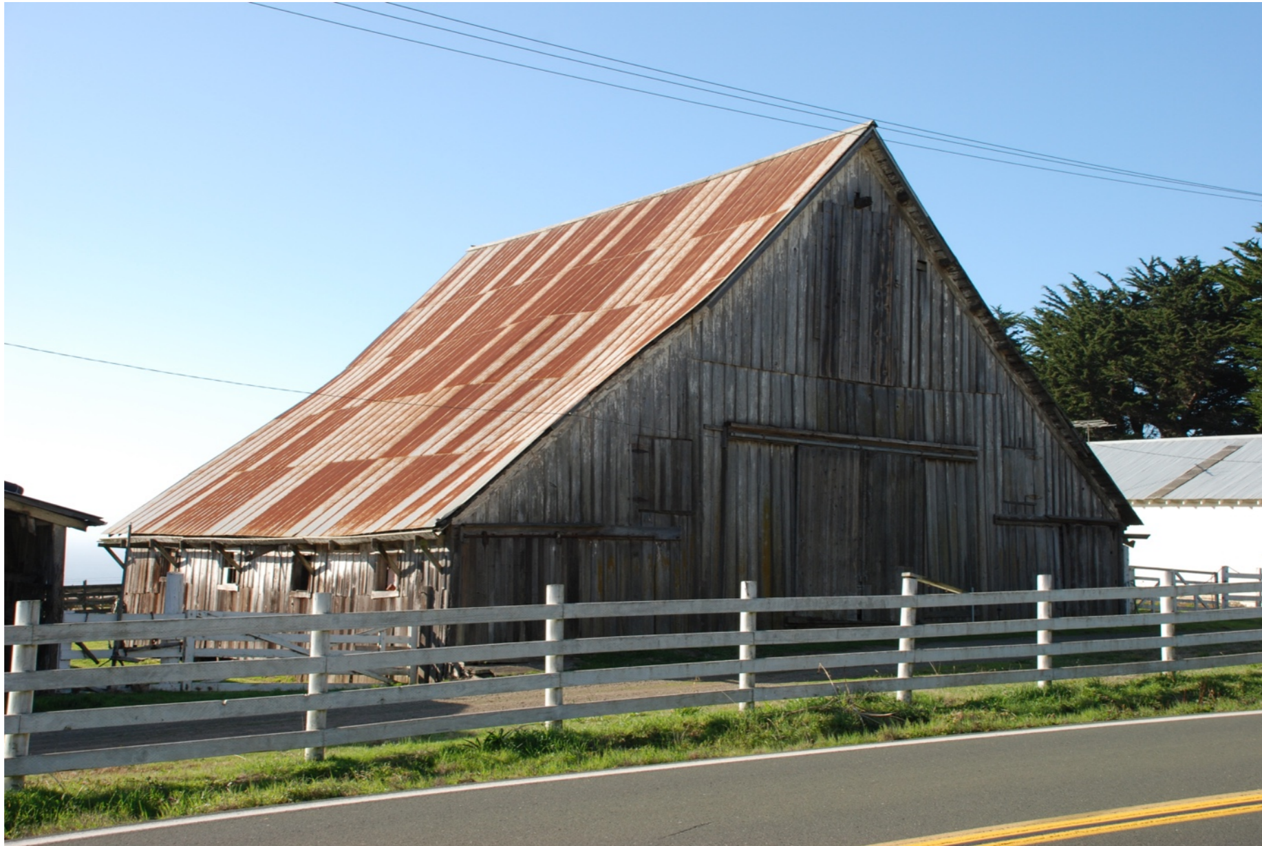
Galletti Ranch Highway One, Manchester, Northern California