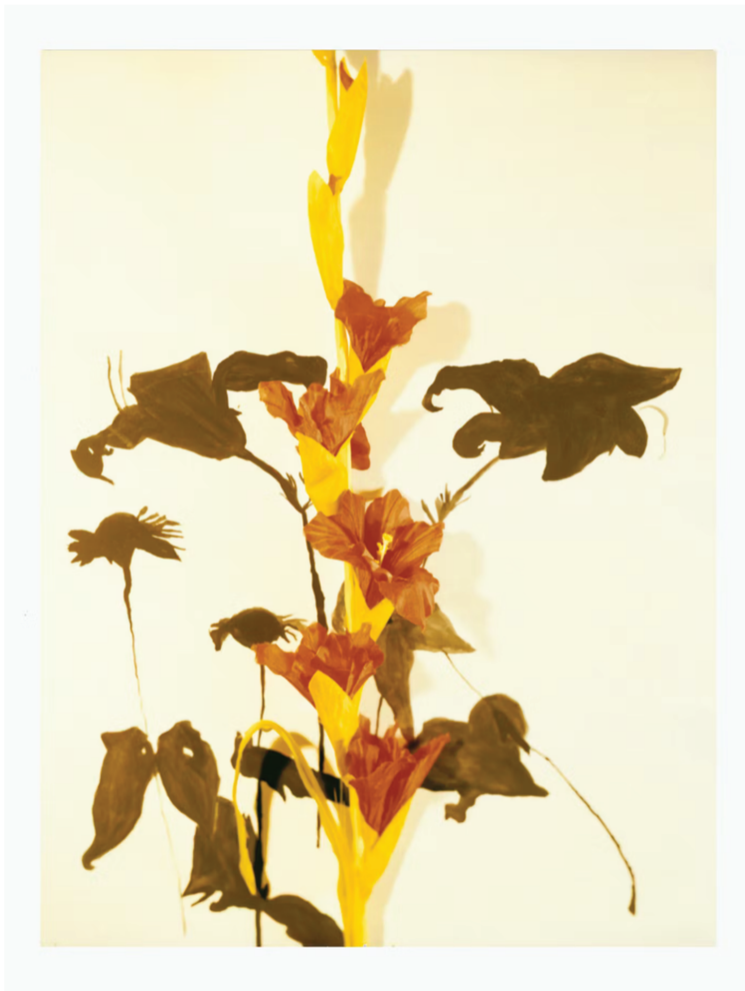
Steep Rock #1 , 2006.