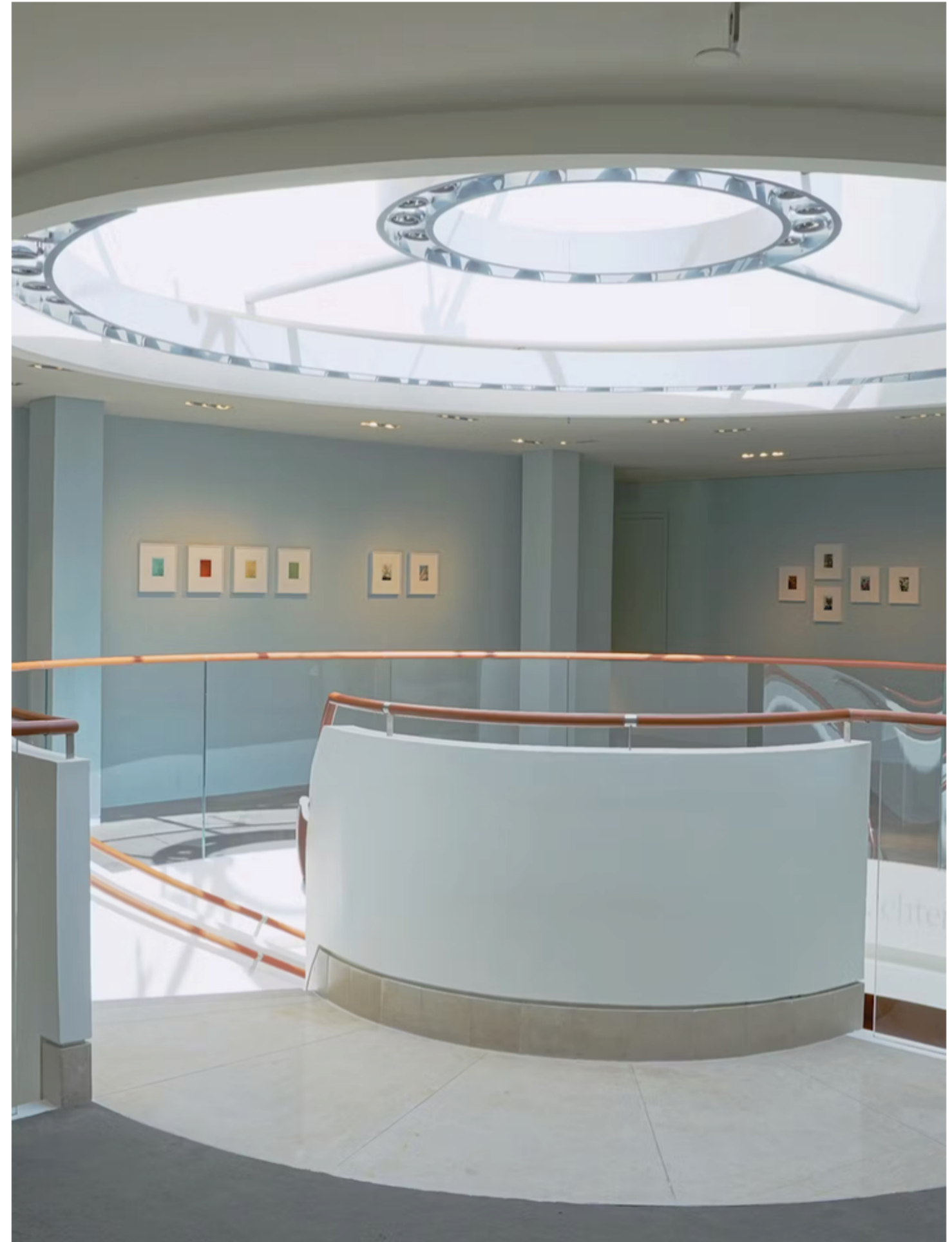
Installation shot of Miranda Lichtenstein's Polaroids.