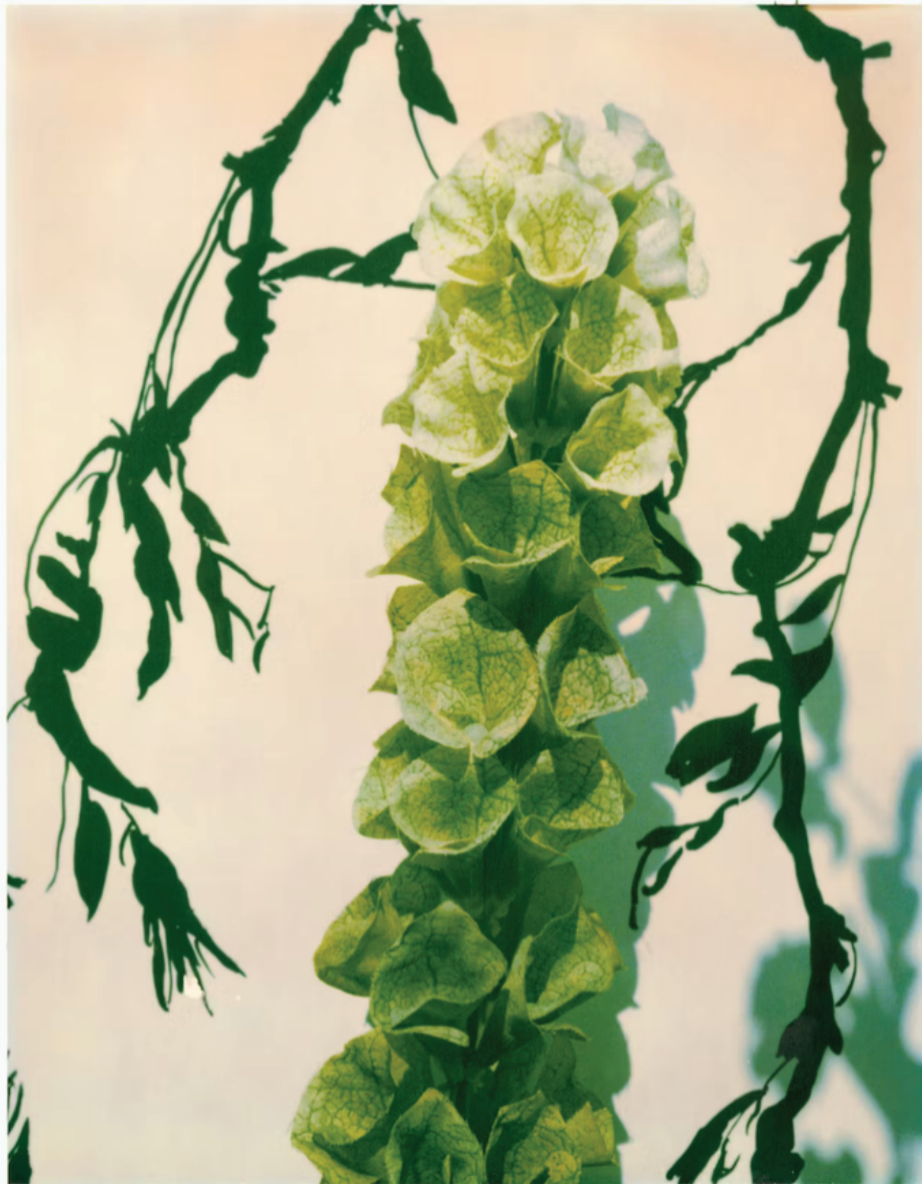
Steep Rock #5 , 2006. Courtesy of La Fondation d'entreprise Hermès and the artist.