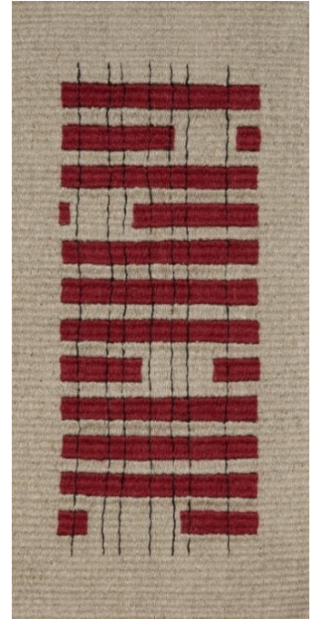
Parchment and Rose